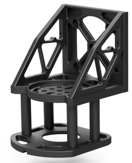
Mitchell female mount